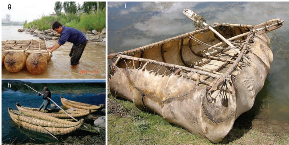
Figure 4. g. Inflated sheep skin raft from Lanzhou, Gansu Province, China [22]; h. Reed boat from Nile River, South Sudan [23]; i. Coracle skin boat from Budha rock, Lhasa, Nepal [24]