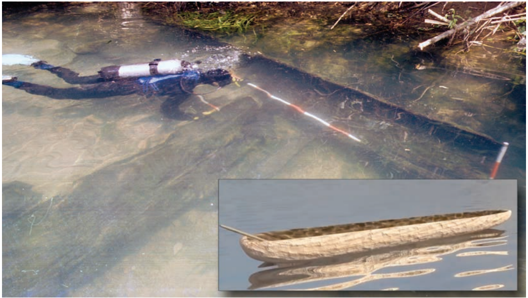
Figure 2. Documenting a Roman logboat from 1st cent. AD in the river Ljubljana at Vrhnika. Bottom right: Reconstruction of a Vučedol culture logboat from c. 2800 BC by Predrag Petrovič, ArtRebel9 Ltd. from Ljubljana

one of the highest in Europe, if not absolutely the highest (Fig. 1). Among the finds are 5 boats/ships with a flat bottom, suitable for shallow water navigation, 76 logboats and numerous oars and boat models.