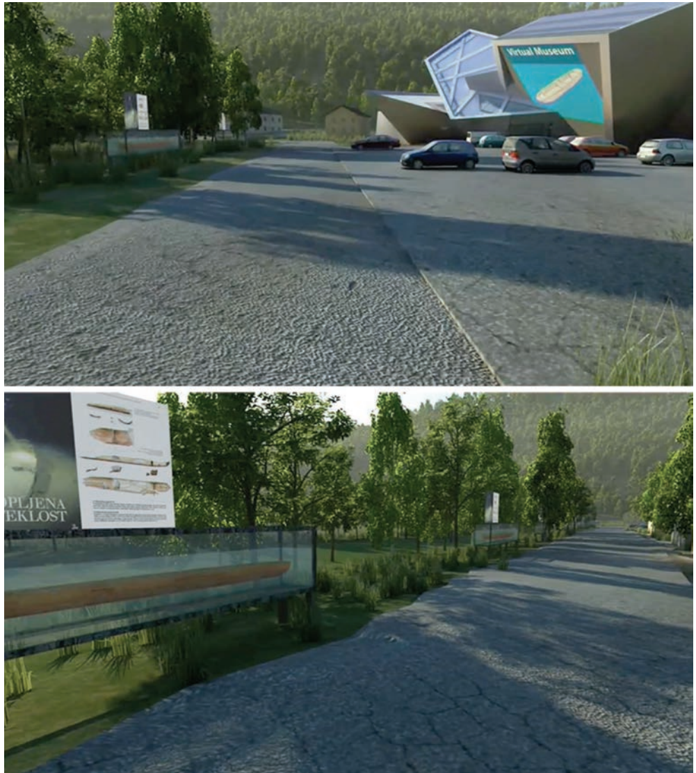
Figure 5. Virtual representation of the GLHP by Nika Lužnik and Michael Klein, 7Reasons Medien GmbH, Vienna.

The task of both connected institutions is a revival of the prehistoric navigational tradition and promotion of awareness of the significance of this invention. It should have the following Units: